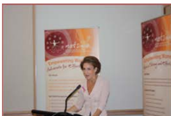
Senator Michaelia Cash Minister Assisting the Prime Minister for Women

We look forward to seeing more of our Members at next year's event in March 2015.