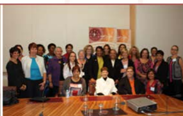
Some of the Women attending our IWD event