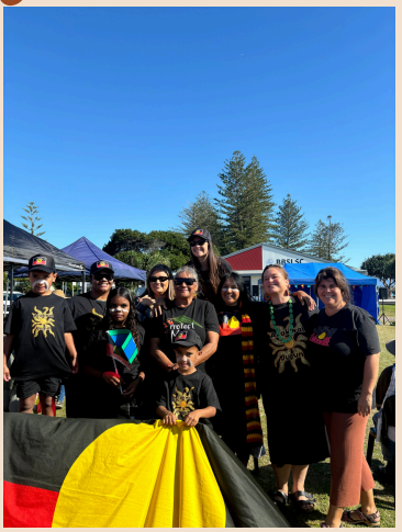
Bundjalung and Arakwal mob!