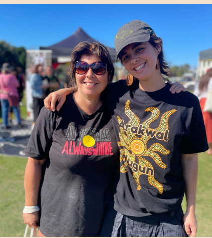
Me and my Mum!!!